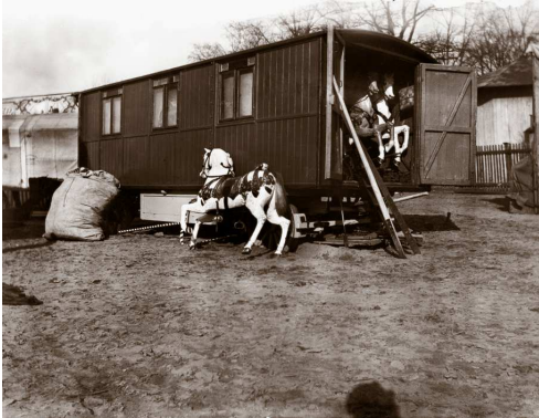
7) Performer's caravan with merry-go-round horses, 1900