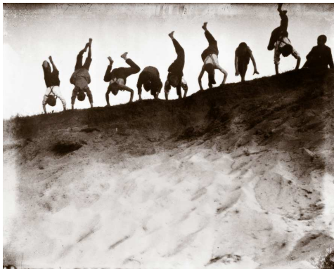
1) Boys doing handstands on a sandy slope, 1898