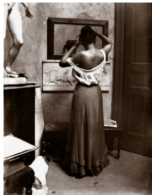
10) Model standing in front of a mirror in the studio of sculptor August Gaul, 1901