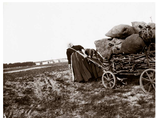
6) Women with firewood-laden cart; Charlottenburg is visible in the background, 1898