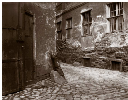
12) House corner and wall in Krögel, 1902