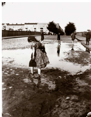
5) Girls on Knobelsdorff Bridge, 1898