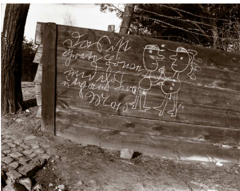
11) Children's drawings on wooden fence, 1901