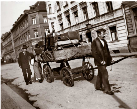
9) Moving furniture with a handcart, 1901