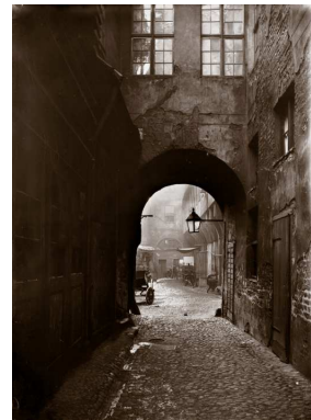
3) Krögel, view from the second courtyard looking towards the first, 1896/97