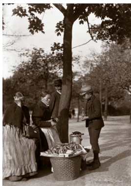
4) Hans Zille at a pretzel stand in the Tiergarten, 1897