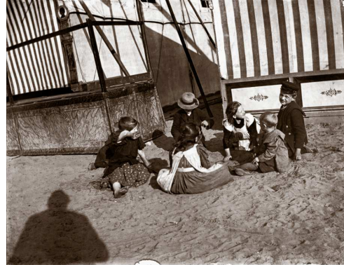
8) Boys and girls sitting on the ground in front of a tent, 1900