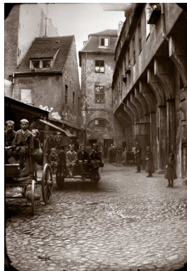
2) Children in the first courtyard in Krögel, viewed from the second courtyard, ca. 1896