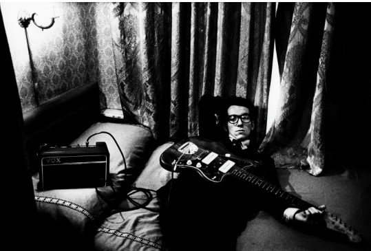
5) Elvis Costello, Amsterdam 1977