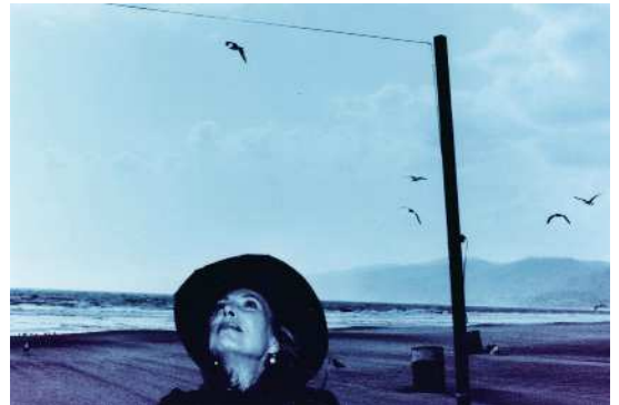
7) Joni Mitchell, Santa Monica 1999