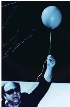
6) Danny DeVito, Los Angeles 1999