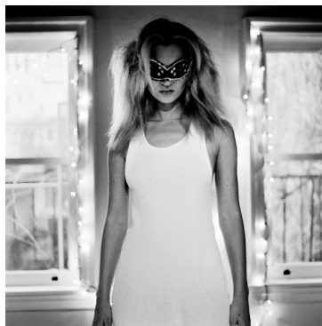
9) Kate Moss, New York 1996