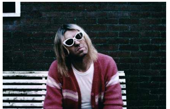
10) 'a.cobain', strijen 2001