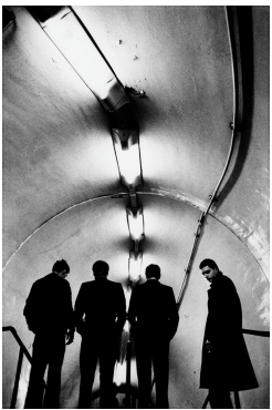
1) Joy Division, London 1979