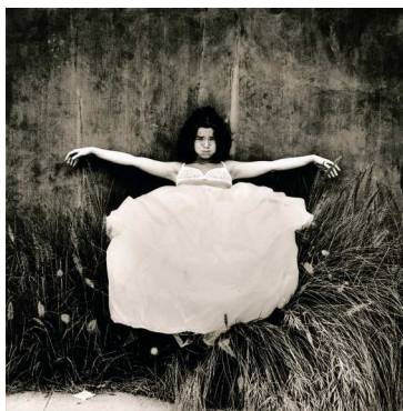
2) Björk, Los Angeles 1994