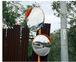
3) Two Mirrors 143,8 x 125 cm