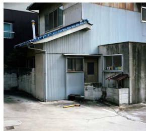
2) Walled in 131 x 125 cm