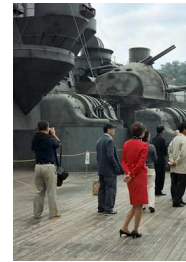
10) On the Battleship 134,7 x 178 cm