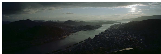
6) Onomichi Sunset 447 x 178 cm