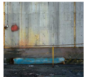
4) The Painter's Palette 124,6 x 125 cm