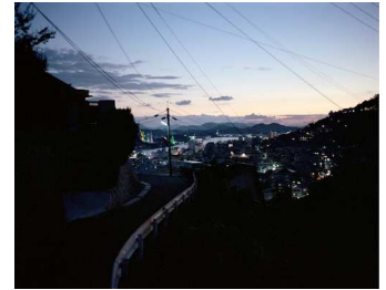
11) Onomichi at Dusk 210,7 x 178 cm