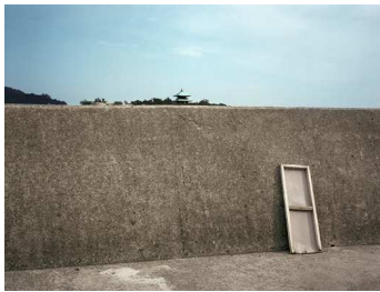
1) The Quay Wall 217,8 x 178 cm

US$ 39.95; Can.$ 49.95; EUR 29.80; CHF 49.-