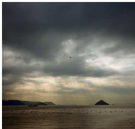
5) The Chopper 124,5 x 125 cm