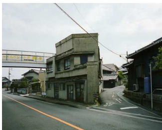
8) The House on the Corner 144 x 125 cm