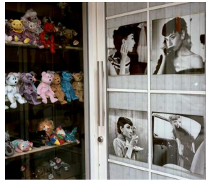
9) Tribute to Audrey 134,9 x 125 cm