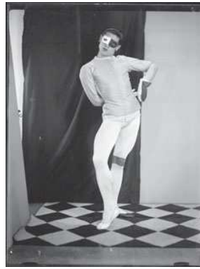
3) Serge Lifar, 1925