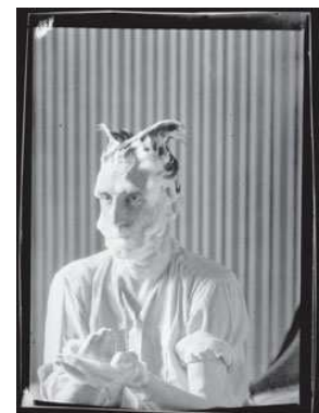
12) Marcel Duchamp, 1921