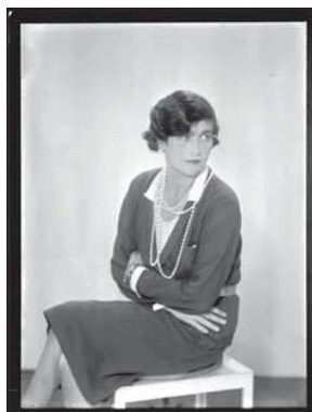
9) Coco Chanel, 1930