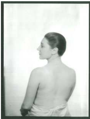
6) Youki Desnos, 1929