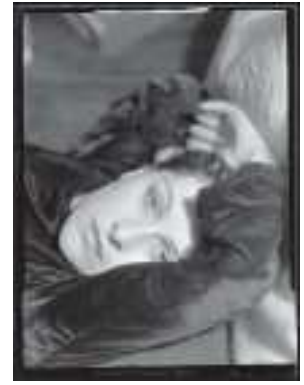
4) Dora Maar, 1936