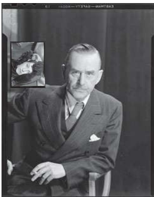
1) Thomas Mann, um 1942

MAN RAY PORTRAITS Paris, Hollywood, Paris 1921-1976 From the Man Ray Archives of Centre Pompidou Paris ed. by Clément Chéroux 320 pages 517 ills. ISBN 978-3-8296-0503-3 EUR 58.-, EUR (A)59.70, CHF 81.90