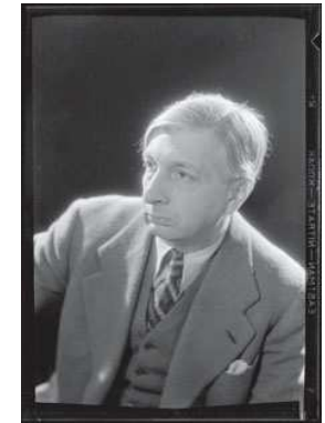
8) Giorgio de Chirico, um 1932