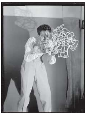
10) Jean Cocteau, um 1925