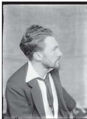
5) Ezra Pound, 1923