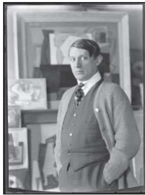
2) Pablo Picasso, um 1921