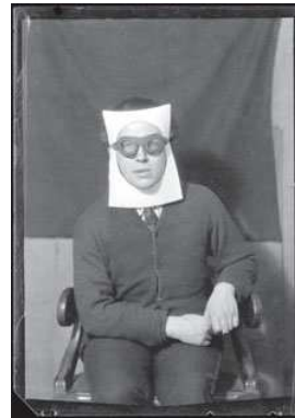
7) André Breton, um 1924