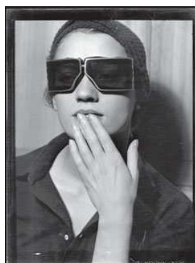
11) Lee Miller, um 1929