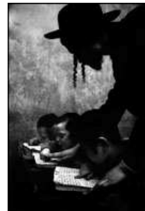
10 Cornell Capa, USA, Judaism Essay, 1955