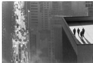
2 Rene Burri, Brazil, Sao Paulo, 1960