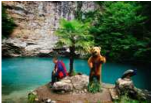
1, Abkhazia, 2005