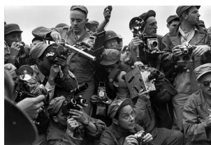
13 Werner Bischof, South Korea, 1952