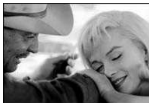
9 Cornell Capa, USA, "The Misfits", 1960