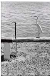
7 Elliott Erwitt, USA, Florida Keys, 1968