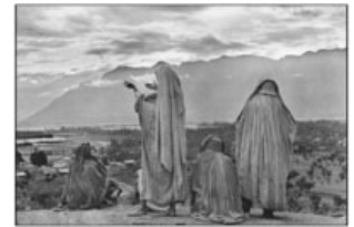
6 Henri Carier-Bresson, Asia, 1947