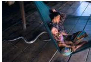
5 Steve McCurry, Cambodia, Tonle Sap, 1998