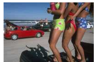
14 Constantine Manos, USA, Daytona Beach, Florida, 1997