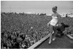
4 Erich Lessing, Poland, 1956