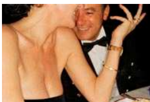
12 Martin Parr, GB, Think of England, 2000