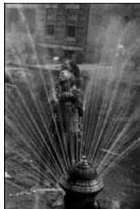
8 Leonard Freed, USA, New York City, Harlem, 1963