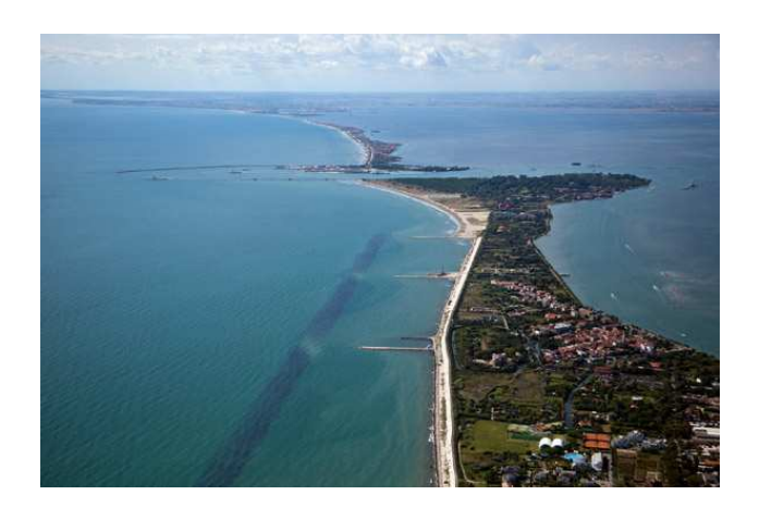
5) View over Lido to South, near Malamocco, Venice, Veneto