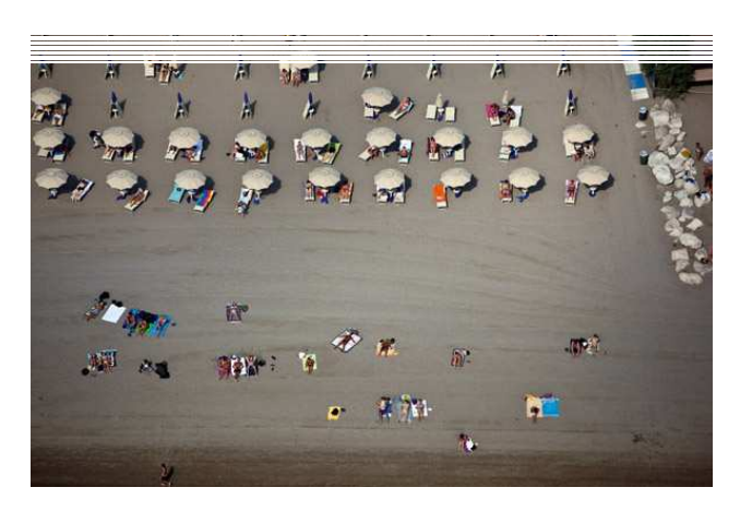
7) Lido, Venice