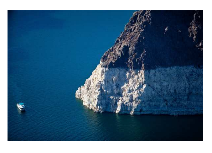
4) A houseboat gives scale to a 100-foot bathtub ring which shows the depleted water supply of Lake Mead. Kingman North, Arizona