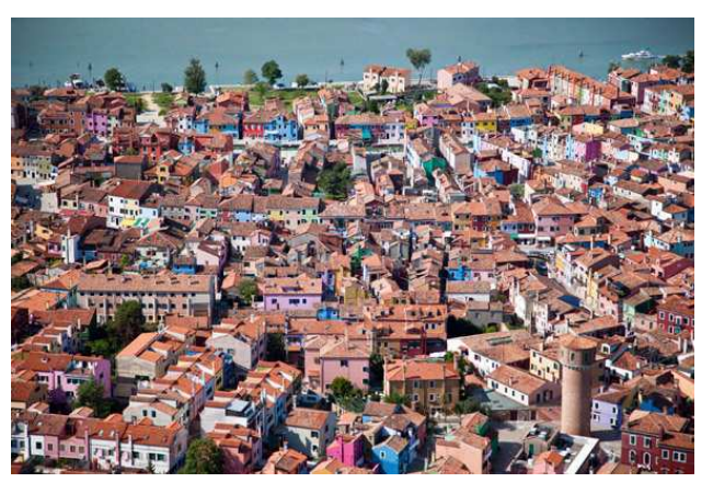
10) Burano with its colourful houses.