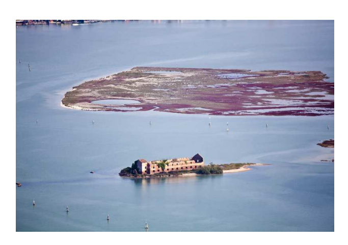
3) The isola della Madonna del Monte is occupied by ruins. Venice, Veneto