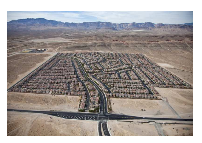
2) The residents of the subdivision will need to drive to services and stores even if strip malls are built along the road frontage. Las Vegas, Nevada