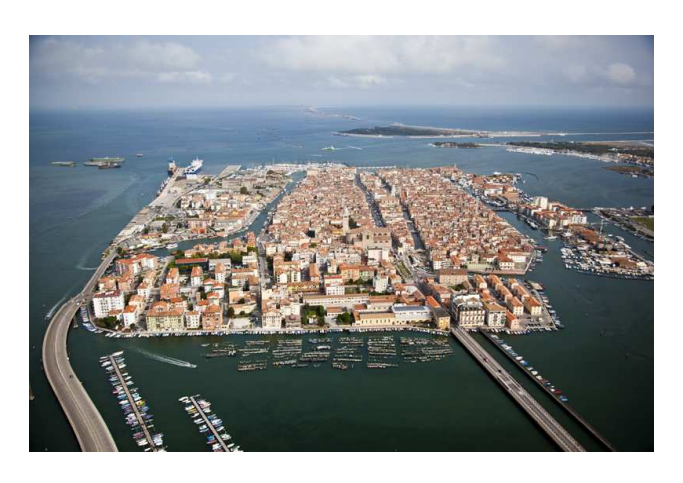
1) Dense island settlement inside the lagoon is connected to the mainland by causeways. Chioggia, Veneto

Fragile Mythen With a text by Wolfgang Kemp 192 pages, 155 color plates ISBN 978-3-8296-0504-5 Retail price: EUR 49.80