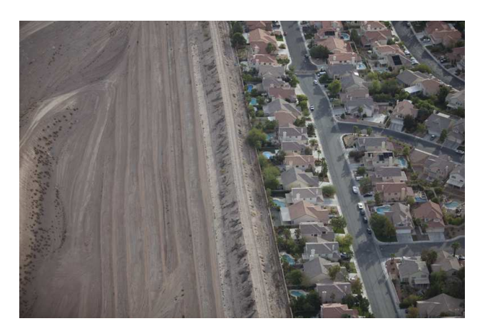
6) Suburban homes developed next to a terraced sand and gravel mine. Las Vegas, Nevada