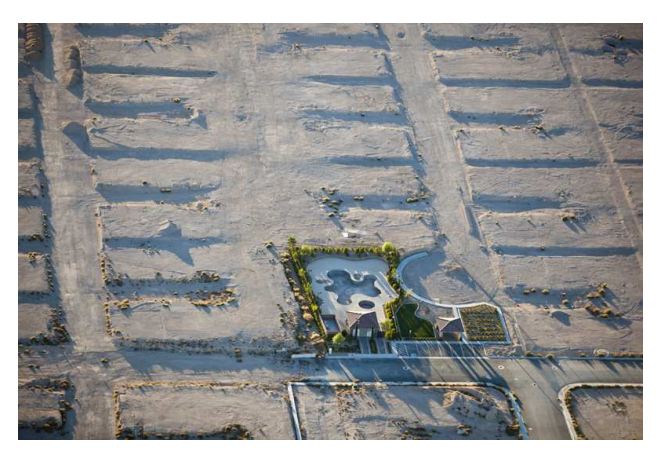
9) A community pool and sale office are the first things built for this spec development. Clark County, Nevada