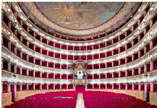
2) Teatro San Carlo, Neapel I, 2009