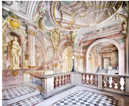
5) Reggia di Portici, Portici I, 2009