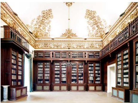
7) Biblioteca Nazionale, Neapel III, 2009