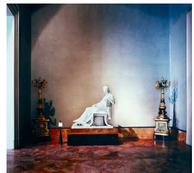
9) Museo di Capodimonte, Neapel III, 2009