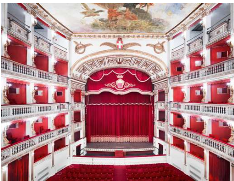
1) Teatro Mercadante, Neapel II, 2009