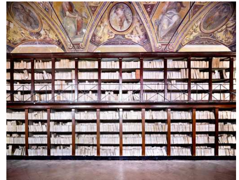
6) Archivio di Stato, Neapel II, 2009