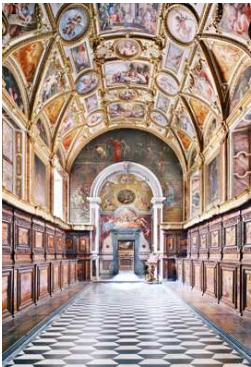
4) San Martino, Neapel II, 2009