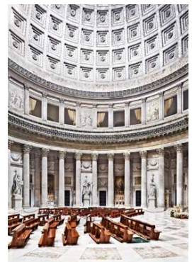
3) San Francesco di Paola, Neapel I, 2009