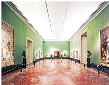
8) Museo di Capodimonte, Neapel VI, 2009