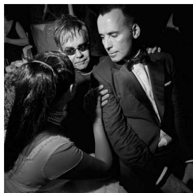
8) Elton John and David Furnish, LA, 2/2009