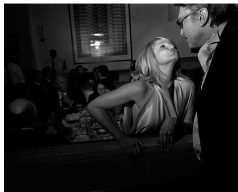
2) Ellen Barkin, LA, 2/2004