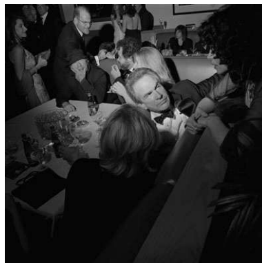
5) Warren Beatty, LA, 3/2001