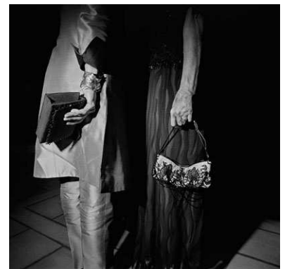
3) LA, 3/2001