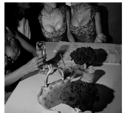
9) Hugh Hefner and Bunnies, LA, 3/2000