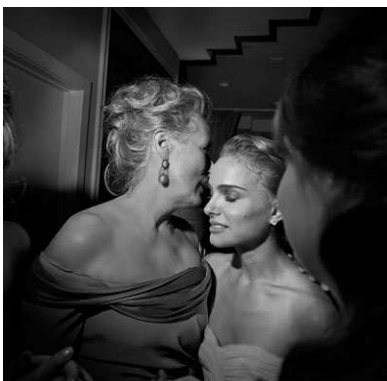
7) Meryl Streep and Natalie Portman, LA, 2/2009