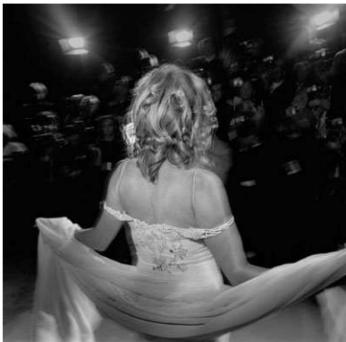
1) LA, 3/2002