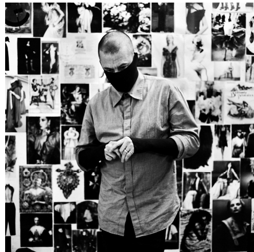
2) Alexander McQueen, London 2007