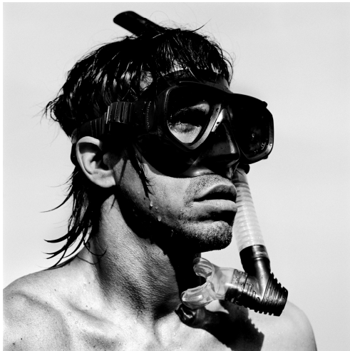
1) Anthony Kiedis, West Palm Beach 2003

Anton Corbijn INWARDS AND ONWARDS With an essay by Francis Hodgson 80 pages, 36 duotone plates ISBN 978-3-8296-0558-8 Retail price EUR 29.80, US $ 39.95