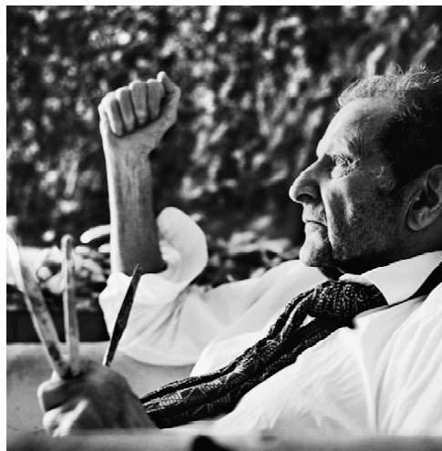
3) Lucian Freud, London 2008