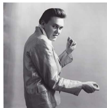
3) Billy Fury, 1961 By David Wedgbury