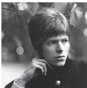
8) David Bowie, 1966