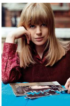
5) Marianne Faithfull, Battersea Park, London, 1965