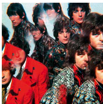
9) Pink Floyd (Cover of Piper at the Gates of Dawn ), 1967 By Vic Singh