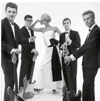
2) The Shadows and Ros Watkins, 1961 By Brian Duffy