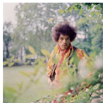
10) Jimi Hendrix, 1967