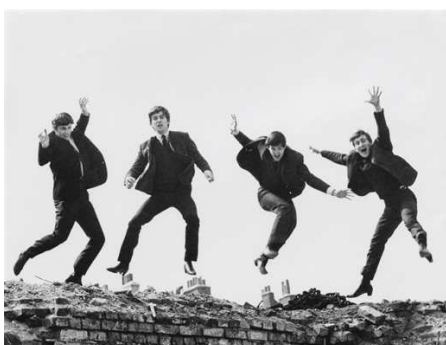
4) The Beatles, 1963 (jumping shot)