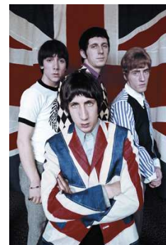
7) The Who, 1966