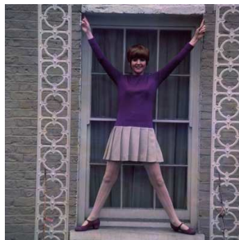
6) Cilla Black, 1965 By Robert Whitaker