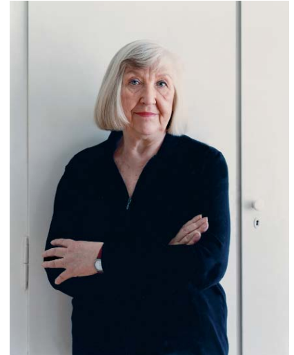
Hilla Becher, 2007